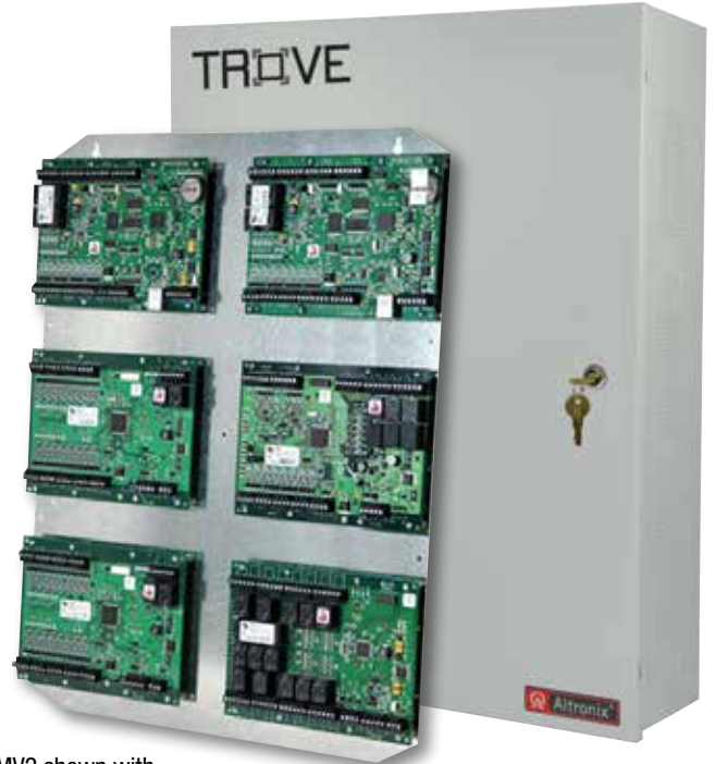
TMV2 shown with optional Mercury boards