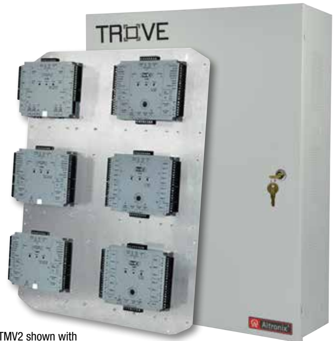
TMV2 shown with optional HID VertX® boards