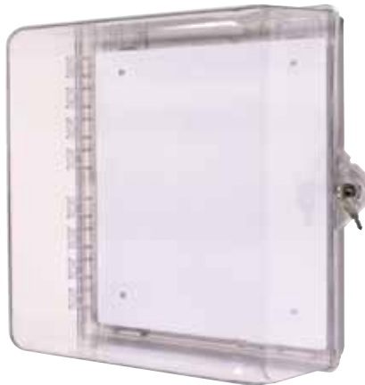
STI-7530 with Key Lock