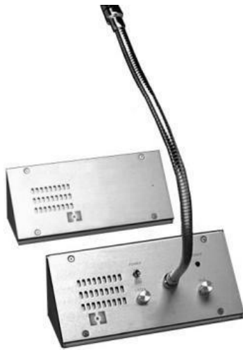
SC-300 Counter-Top Ticket Window Intercom System