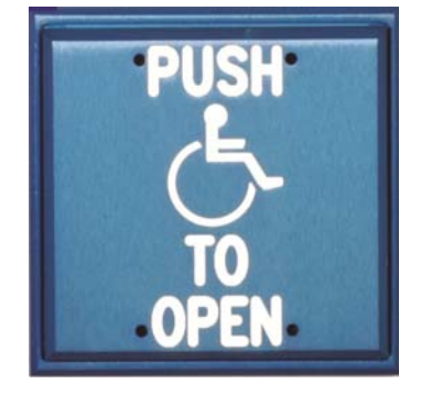
ADA PUSH TO OPEN BLUE FINISH WHITE FILL

PRESS TO OPERATE DOOR CLEAR FINISH BLACK FILL