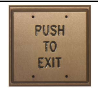
PUSH TO EXIT BRONZE FINISH BLACK FILL