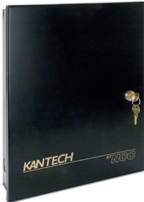
Note: North America model shown