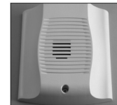
External Sounder provided with base model (DE8310)