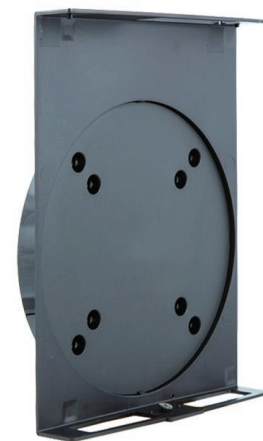
Rotating VESA-Mount Bracket (snaps over top and bottom of Appliance)