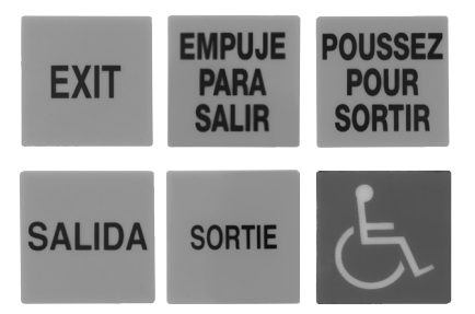
Red and green pushbutton inserts available in English and Spanish or French.