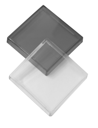
Dimensions 2-3/4" x 4-1/2" (70.0 x 114.5mm)