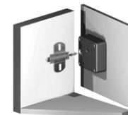
Pivoting Door Mount Installs using Standard Locking Pin