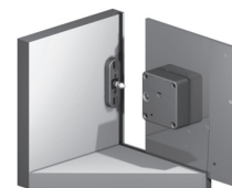
Sliding Glass Installs using Locking Pin with Alarm function and Glass Mounting Kit