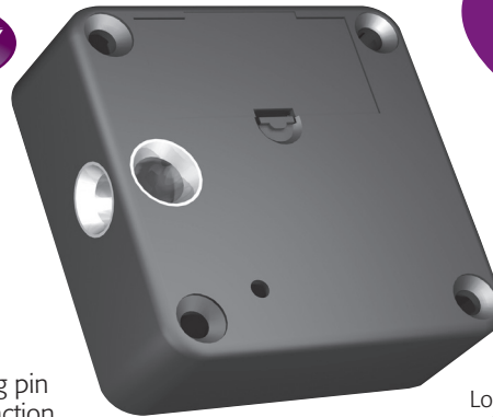
Shown: Locking pin with alarm function