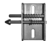
Locking Pin with Spring Release (No alarm function)