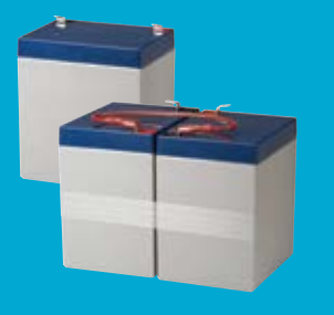
B-12-5 / B-24-5 Lead Acid Battery